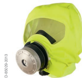
Dräger PARAT® 5500 Escape hood

Replacing the filter after 8 years will extend the service life of the Dräger PARAT Escape Hood to 16 years in total. For this, Dräger offers filter replacement service or an expert training for your employees. In the long term, this offers you great cost savings.